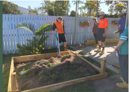
Cert I Construction crew building raised veggie patch at the centre for the community garden.